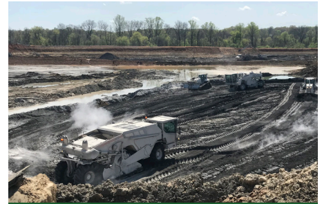
LIME FINES BEING MIXED INTO THE ASH WITH A RECLAIMER

The results of using Quicklime to treat the ash were significant. Within hours of mixing the Pebble Quicklime and Quicklime Fines, the ash was able to be transported and placed into the on-site landfill. By supplying two gradations of Quicklime, the timeline constraints were met and the project was completed ahead of schedule.