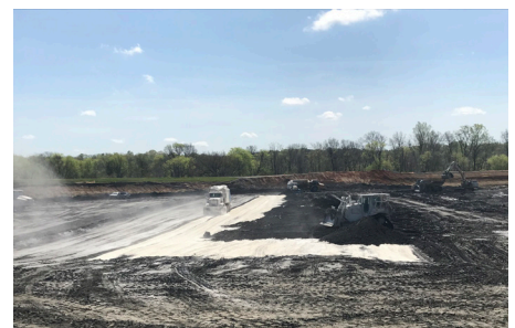
LIME FINES BEING SPREAD BY A SPREADER TRUCK