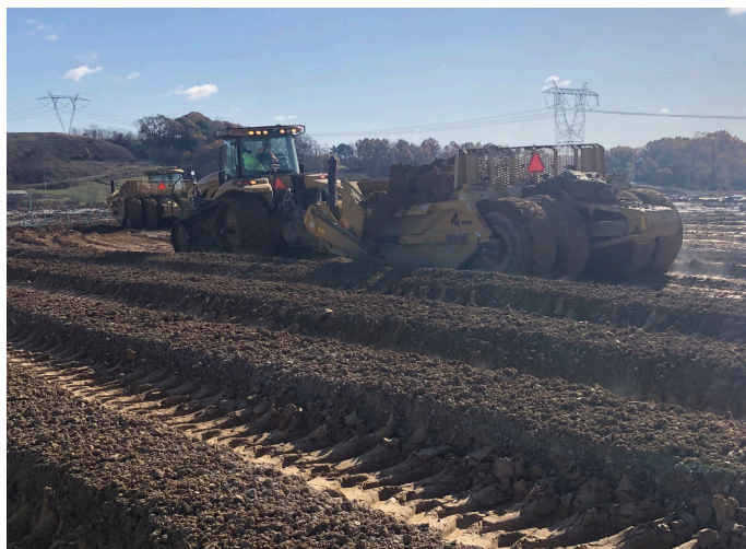
Compacting Treated Soil