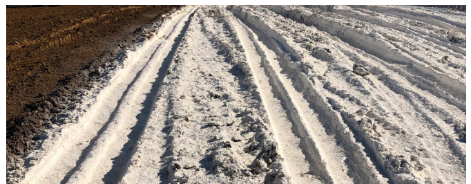
Quicklime being laid on frozen soil