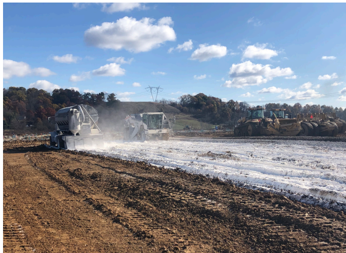
Spreading Quicklime & Mixing With Reclaimer

When cement stabilizing soils that are less conducive to lime, cold temperatures can significantly reduce Portland cements effectiveness. Adding just 1%-2% quicklime with the cement can provide the heat needed for it to react and harden as it would under warmer temperatures.