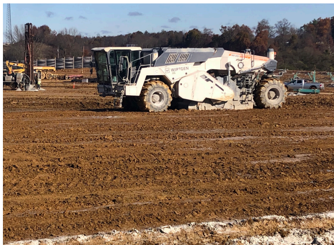
Workable, Treated Soil